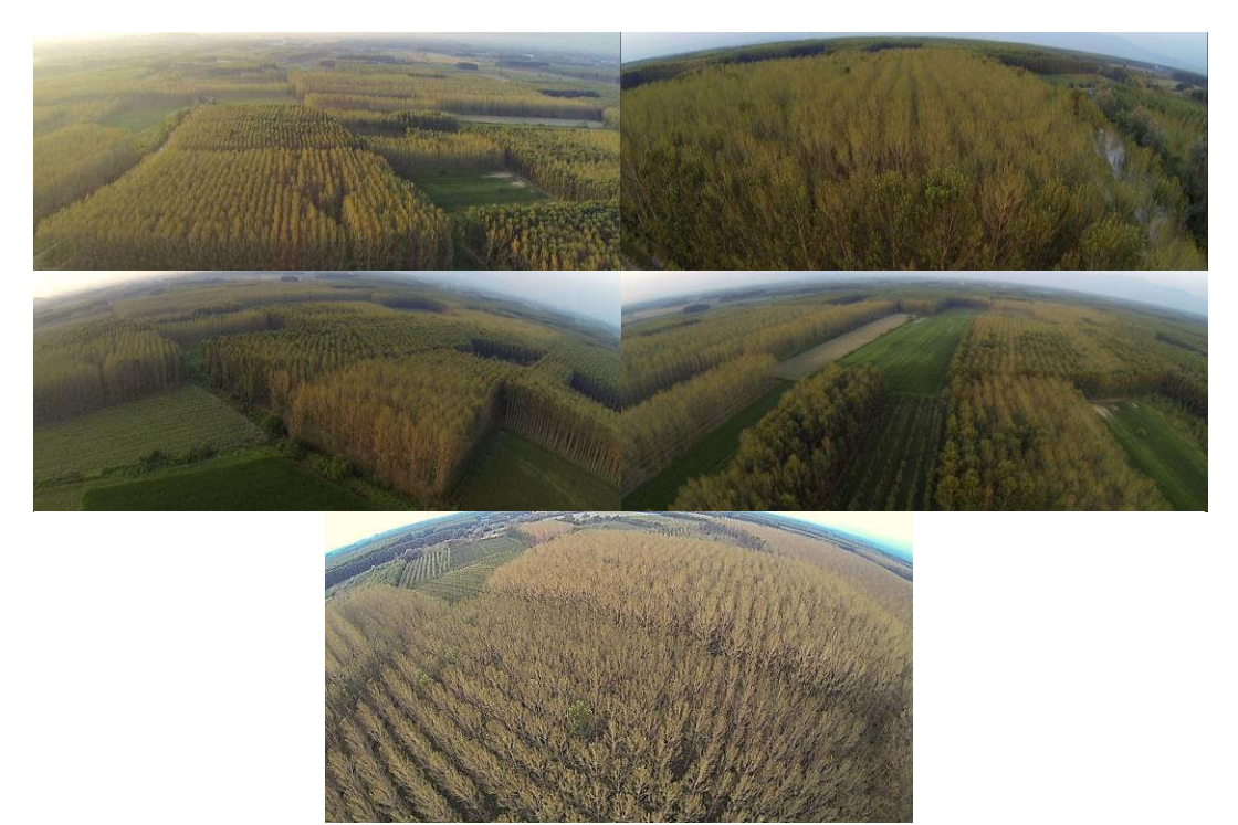
Figure-2. General views of epidemy of Clostera anastomosis in populus plantations in Akyazı and Erenler district in Sakarya province.

anastomosis were based on from the ownerless Populus sp. and Salix sp. along the Sakarya and Mudurnu riverbed. The outbreak, as of August 26, 2015 (in 2500-3000) is estimated to occur in the area. The epidemic has been found to occur entirely on private ownership in the popular plantation (Figure 2).